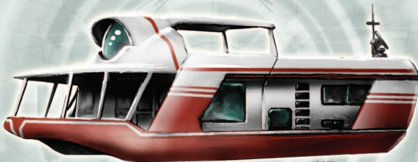
MITSUBISHI WATER HOME