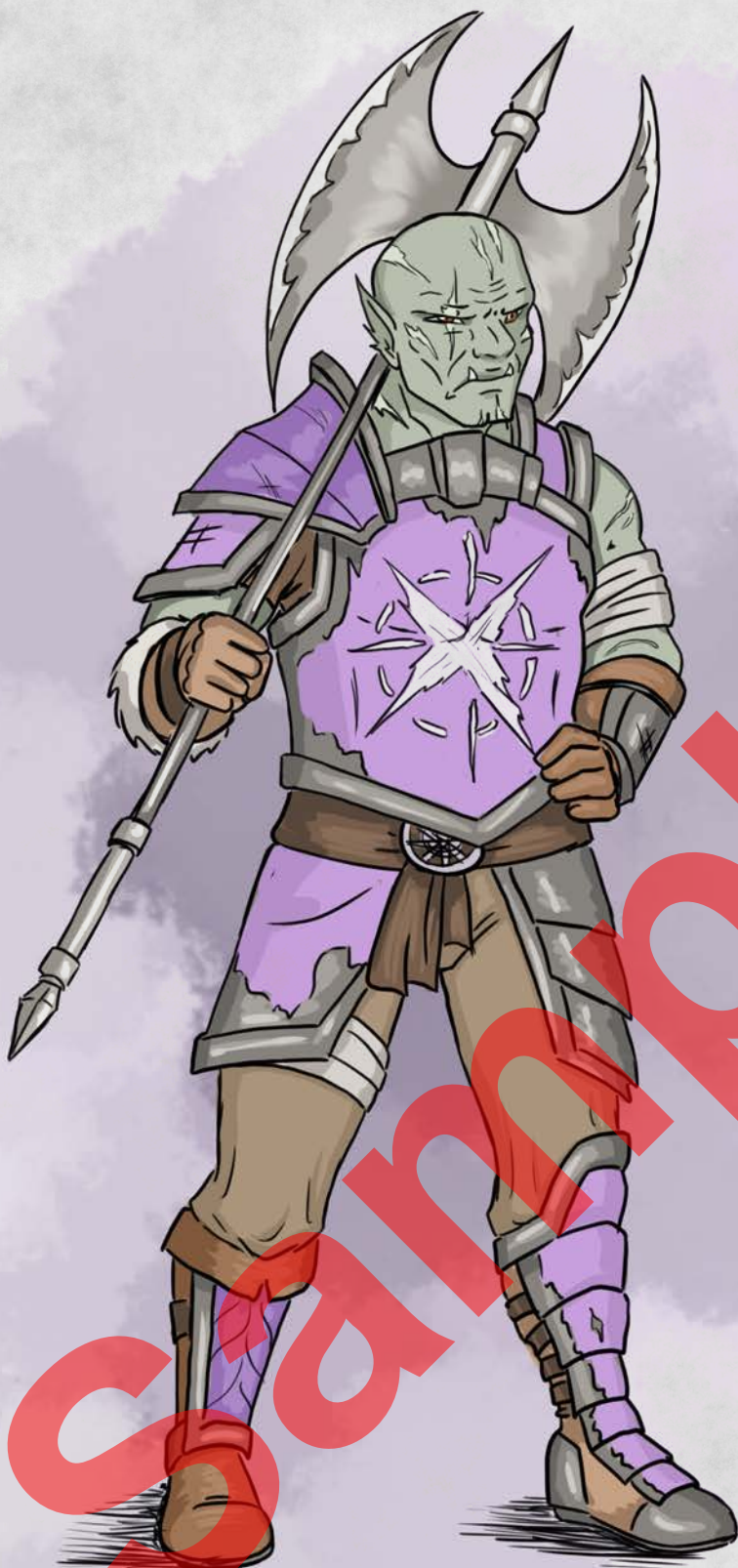
Rindar of Little Faith, Orc Godbanger Paladin

Rindar of Little Faith was once a peaceful yet foul-mouthed orc farmer, working the land and providing for his family in the quiet village of Stonepea. After the Theomachy brought destruction to his farm and death to his family, Rindar picked up arms against the gods and became a godbanger. Rindar is easy to anger and seems menacing, but deep down he is a romantic orc who hopes to one day find love and start a new family again. Rindar's never-ending struggle against the gods and their minions brought him to the ruins of Whitebay, where he faced a difficult dilemma and had to trust his new friend and ally Lucifae Carver (see "Theomachist Allies" later in the book) in order to overcome the evil schemes and divine machinations the warring gods had put in his way. Rindar loves Holybang Cards and has some particularly rare cards in his possession.