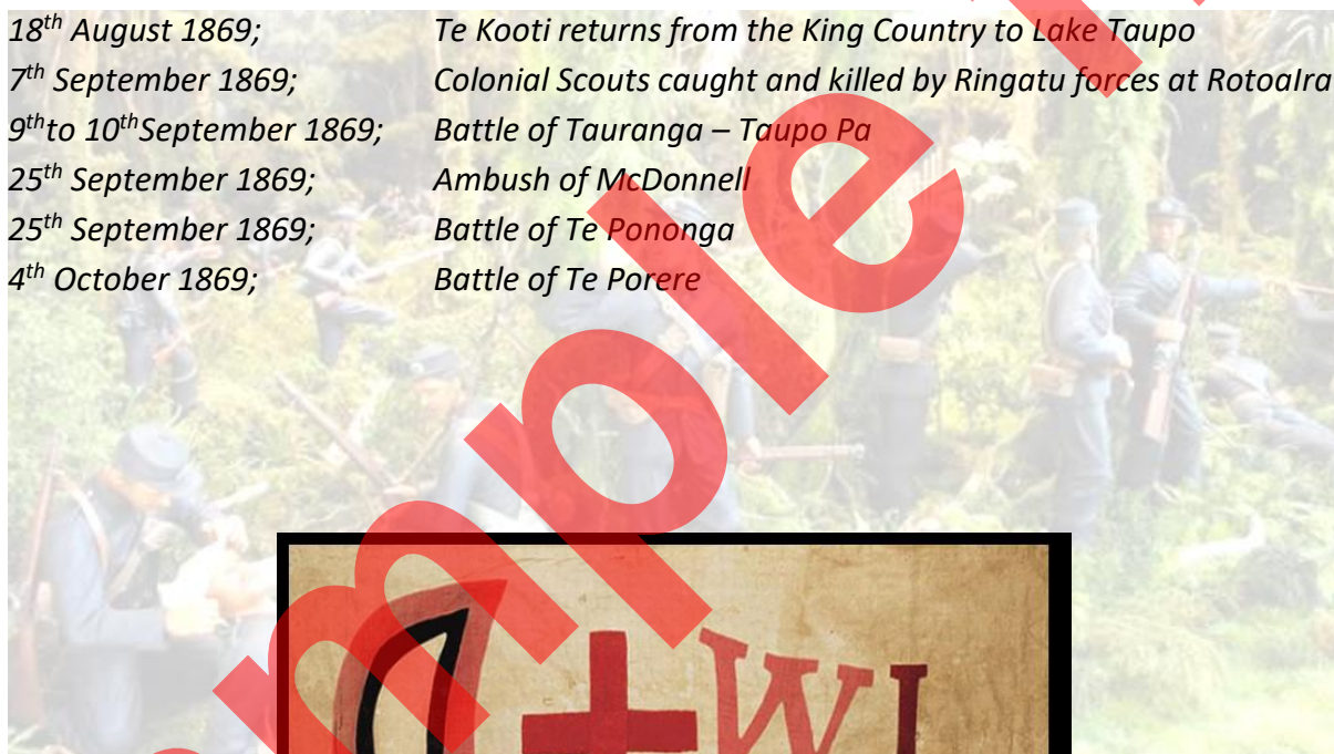
Te Kooti's Flag at the Battle of Te Porere.