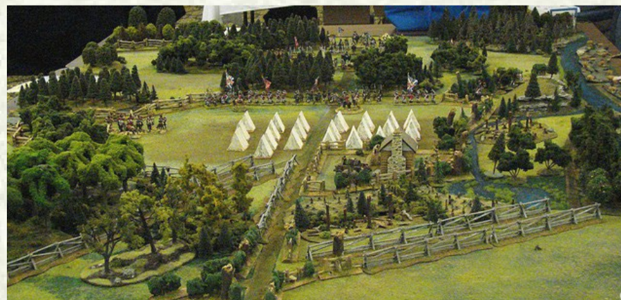
A Johnny Reb AWI variant game in progress.