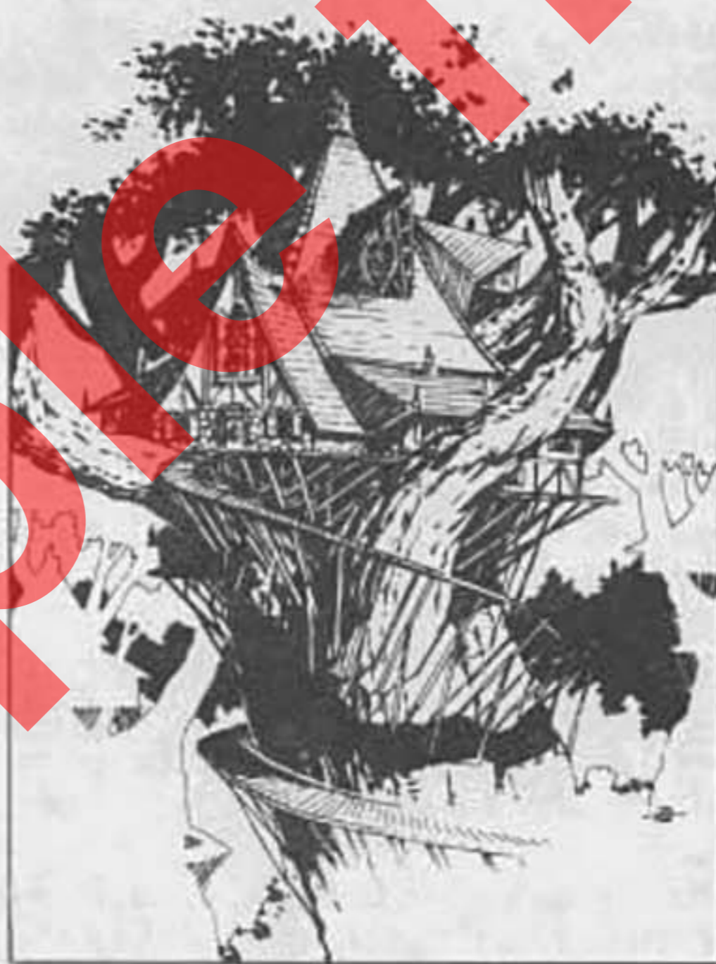
The new Inn of the Last Home.

As Otik was later wont to say proudly (and somewhat inaccurately), "The War of the