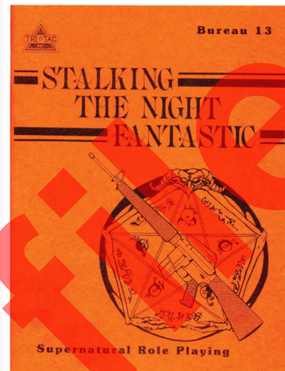
Stalking the Night Fantastic 1983

Since the Massacre of '77, Bureau 13 has come into it's own as a modern, tech-savvy force, with Agents trained to take on corrupted technomages, hell-infested hardware and alien interlopers as well as more traditional venial evils and supernatural incursions. The mandate of Bureau teams remains the same: disposal of high level evil while reinforcing the secrecy that will keep an unknowing public from the edge of insanity.