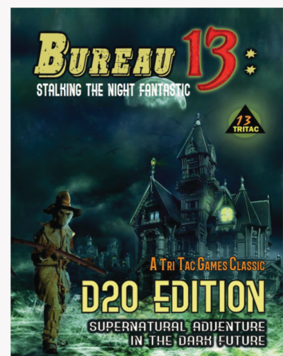
d20 Modern Adaptation 2008