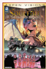
DIRECT EDITION BY -GIUSEPPE CAFARO & VALENTINA TADDEO

COMICRAFT | BLAMBOT | ROBIN SPEHAR - FONTS -