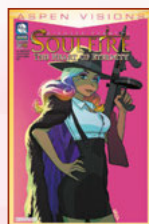
DIRECT EDITION BY -MICAH GUNNELL