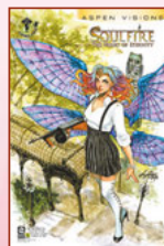
EMERALD CITY COMIC CON 2019 EXCLUSIVE LIMITED EDITION OF 100 BY -SIYA OUM