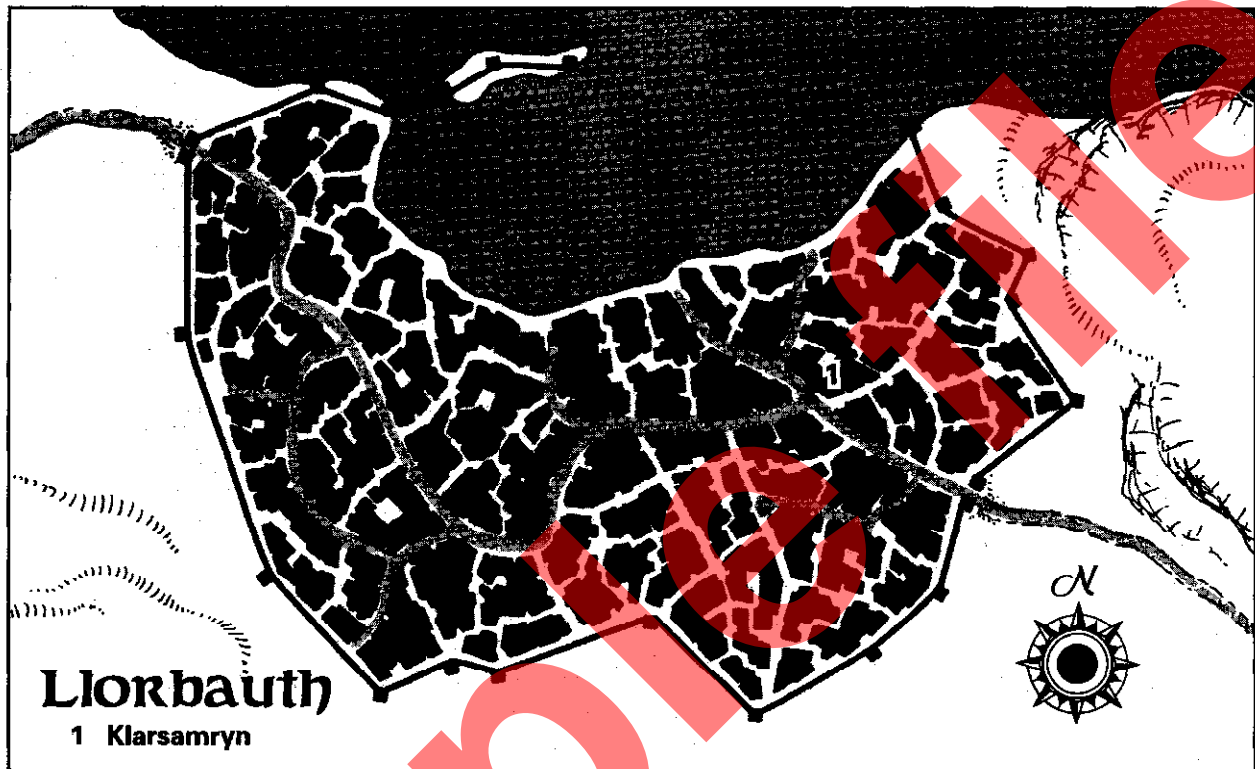
Llorbauth 1 Klarsamryn

•The Mystics' Academy is an academic school for mages, alchemists, and a small sect of Azathan and Mystran priests. It lies south of Llorbauth, on the shores of the Deepwash between Llorbauth and Duhlnarim.