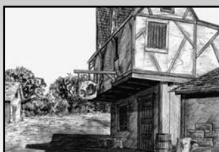
The Thirsty Hound

If the PCs have the shovels Veoden offered them, it only takes 30 minutes (with two people digging) to uncover the coffin of Atuur. The casket is wrapped in steel chains and held by two stout locks. The lid is tightly shut but easily opened once the chains are removed, to reveal the decaying body of Atuur Dairoo.