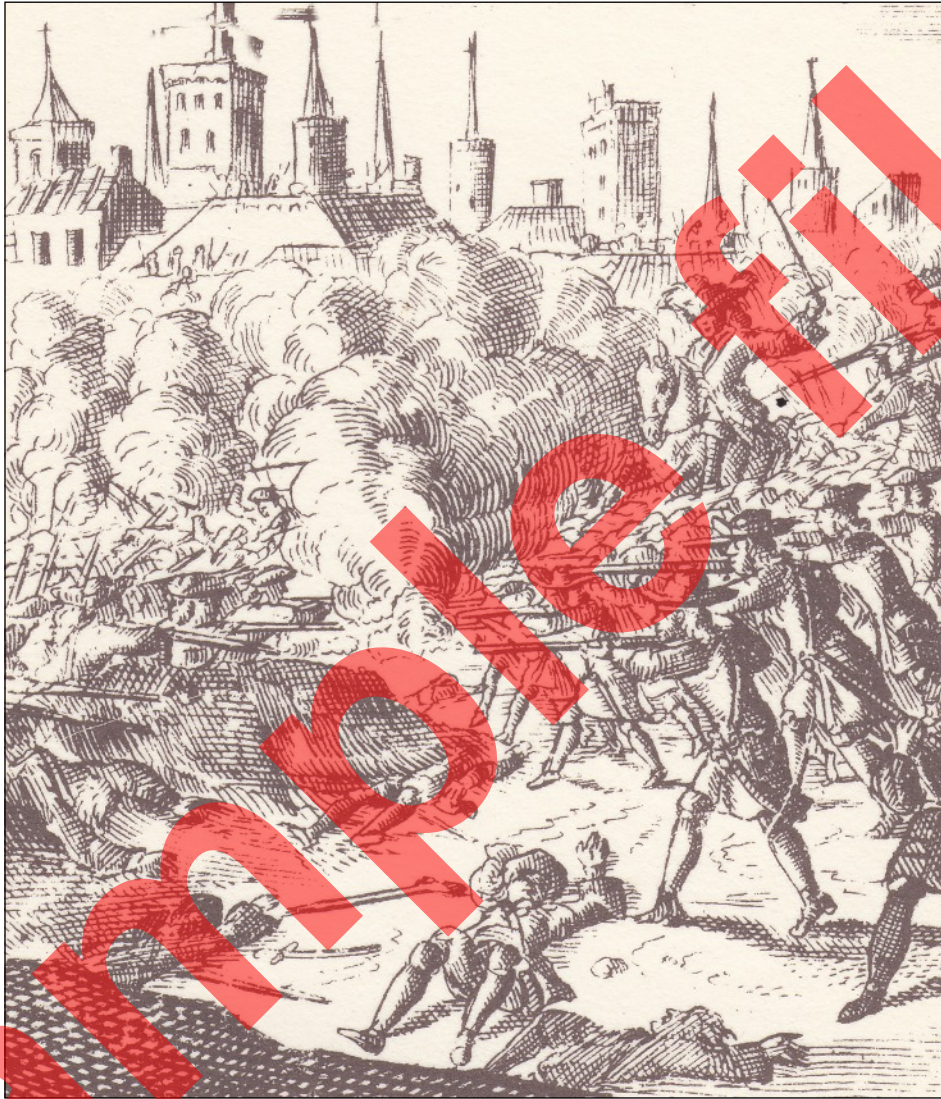
The Battle of Turin

selves unpopular. Won also by the bravery and exertions of Philip himself, they rallied around their acknowledged sovereign, and, instead of waiting for an attack, became themselves the assailants.